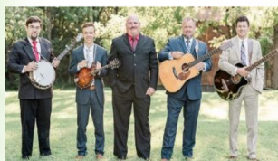
KING JAMES BOYS

CAMPING & LODGING JAMMING & WORKSHOPS FOOD ALL DAY & DRAWINGS WATERSLIDE & TUBING ON THE CEDAR RIVER